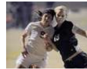
RHS vs EID girls soccer