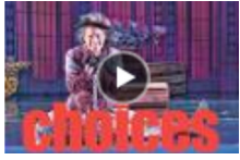
Choices weekend picks (1-6) Jan 5, 2012