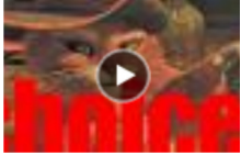
Choices weekend picks (10-28) Oct 27, 2011

Visalia man arrested in weapons possession case (Visalia Times-Delta and Tulare Advance-Register)